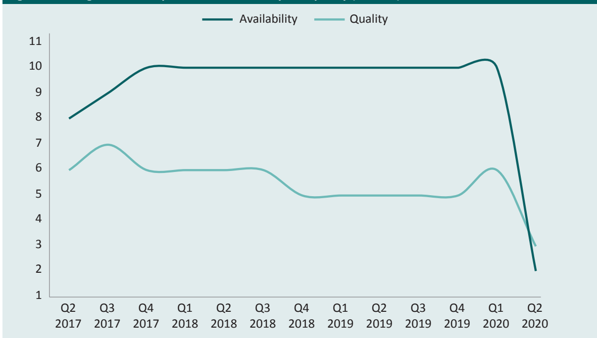
Figure 1: Ratings of methamphetamine availability and quality (median)